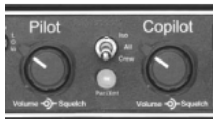
Figure 4 Volume Controls

The pilot volume control knob adjusts the loudness of intercom and music in the pilot's headphones only. It has no effect on selected radio audio levels. The