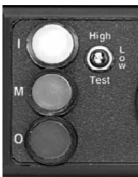
Figure 5 Marker Beacon

The Amber lamp, labeled "M," is the Middle Marker lamp and is coupled with a 1300 Hertz tone. It is keyed alternately with short 'dot' and long 'dash' bursts at 95 combinations per minute.